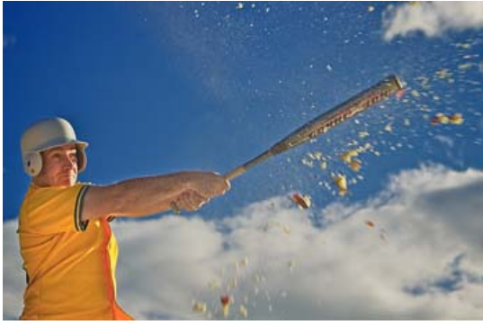
Apple Smashed Direct Hit