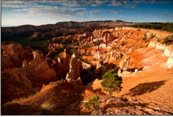
The Columns Bryce Canyon Utah Judi Neuman