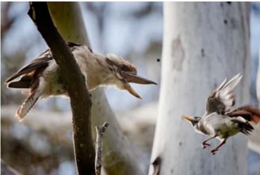
Standing your ground Pierre Boudib