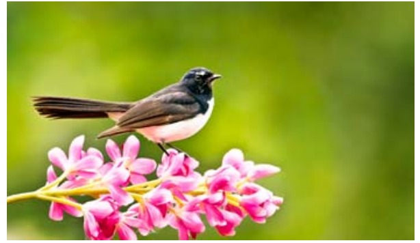
Willy Wagtail Lex Franks