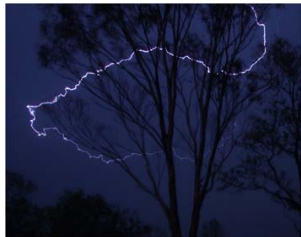
Lighting Wrap Brian Aston