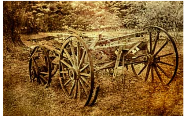
End of the Road Keith Power