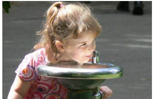
Grand daughter by Dave Hurst