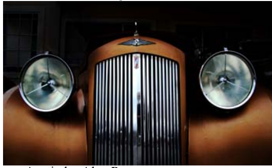
Austin