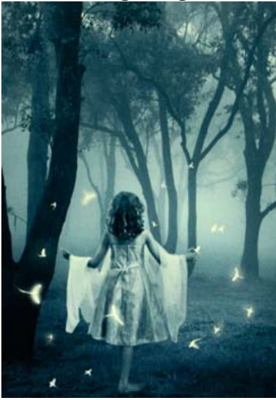
My Secret Place by Di Myall