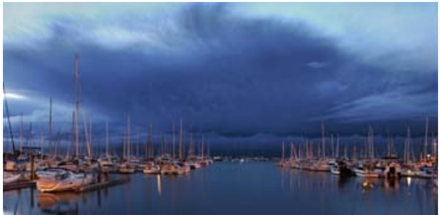
Looks Like Rain Pierre Boudib